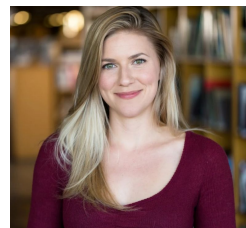
Leasing Crew 0738434511