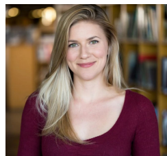
Leasing Crew 0738434511