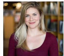
Leasing Crew 0738434511