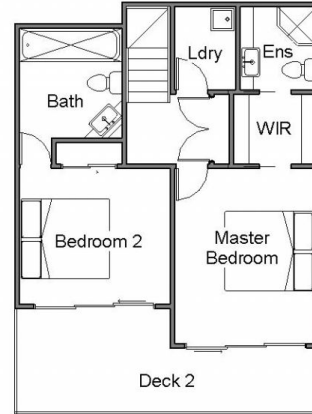
Lower Level 2