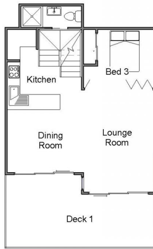
Lower Level 1